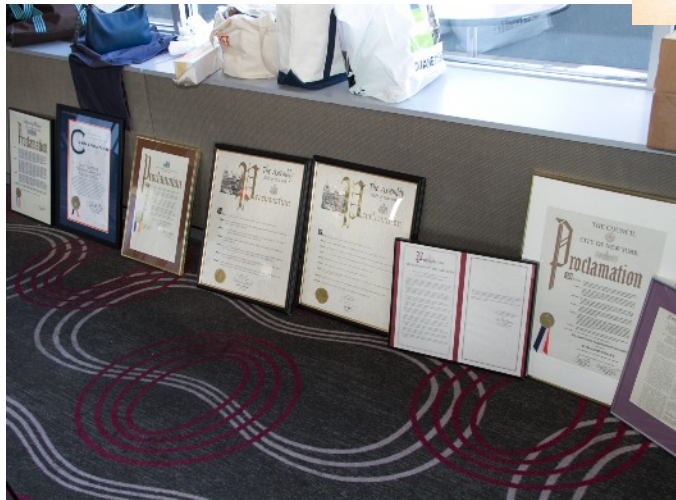
Proclamations from elected officials!