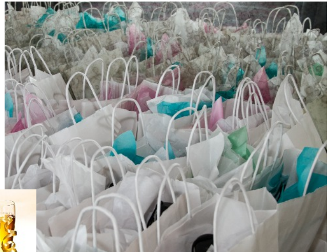
Your gift bag awaits!