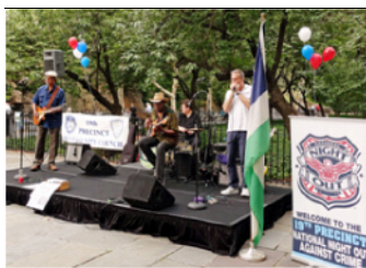
The French Cookin' Band

With a strong turnout of community-minded citizens on Tuesday night, August 2 nd , the 19 th Precinct Community Council marked the gathering of neighbors and law enforcement with smokin' music provided by The French Cookin' Band, soul-satisfying food from Maz Mescal, Butterfield Market, Gotham Pizza and the only-in-New York Ice Cream Truck – sans music! Now in its 33 year nationally, Night Out.. presents an opportunity to enhance the relationship between neighbors and law enforcement while bringing back a true sense of community. We are indeed fortunate here in the East 60s to have the best law enforcement team in the world. Three cheers for the 19 th Precinct!