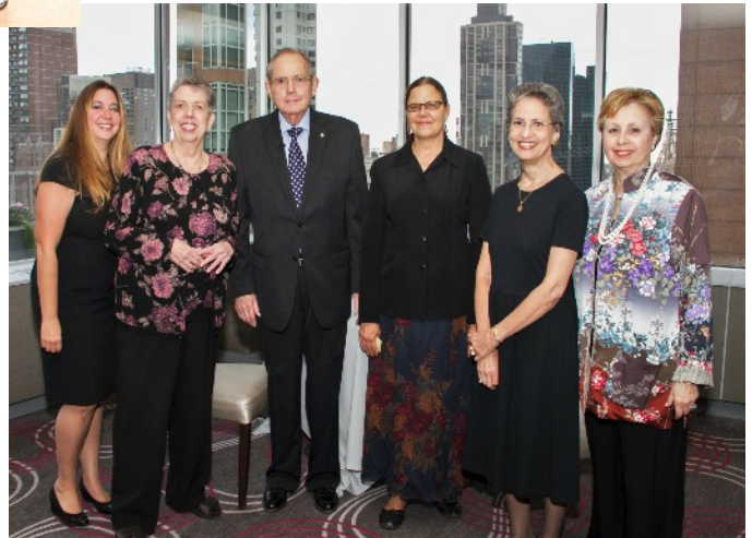
Members of the ESNA Board of Directors.