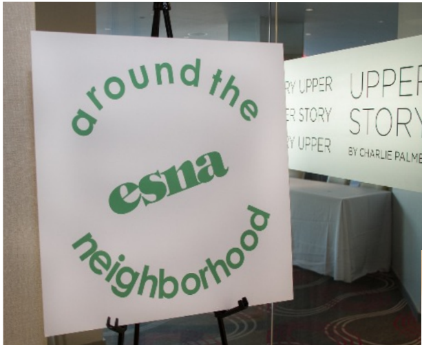
ESNA welcomes you!